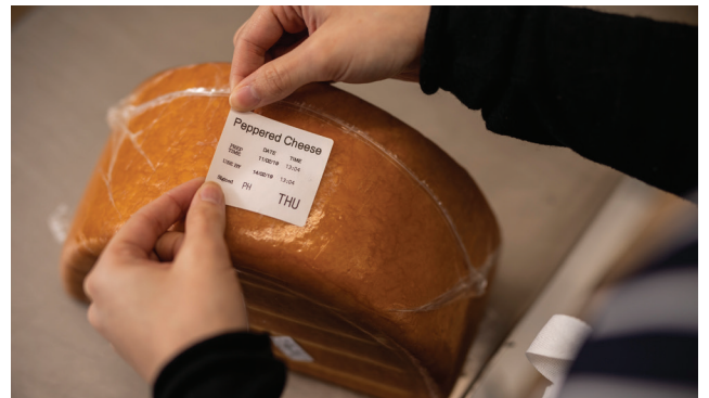
The adhesive used in Brother RD rolls has been certified safe for food labelling