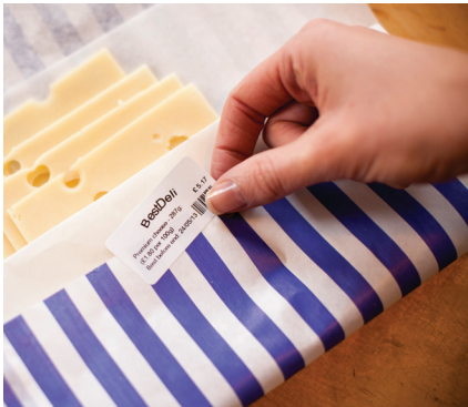
Ensure the safety of your customers with clear 'Use By' labels

Increase productivity and efficiency by enabling busy retail workers to print a wide range of labels on the shop floor by incorporating your TD-2000 series with a trolley/mobile workstation. With its compact design, it's also ideal to use on crowded retail desktops and counters without sacrificing valuable workspace for a standard sized desktop printer. Sharp text, logos and barcodes printed quickly on high quality Brother media can help contribute to enhanced customer satisfaction at the counter or check out.