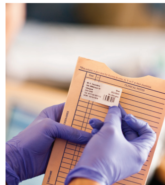
Locate patients' records and other important documentation quickly with an identification label