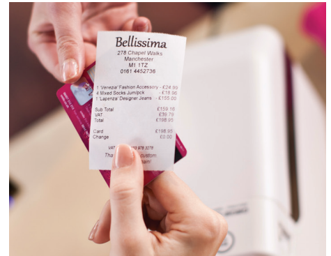
Provide your customers with clear/concise sales receipts