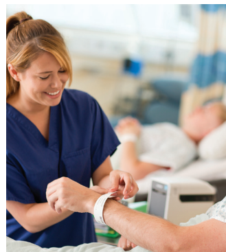
Print basic patient details when required