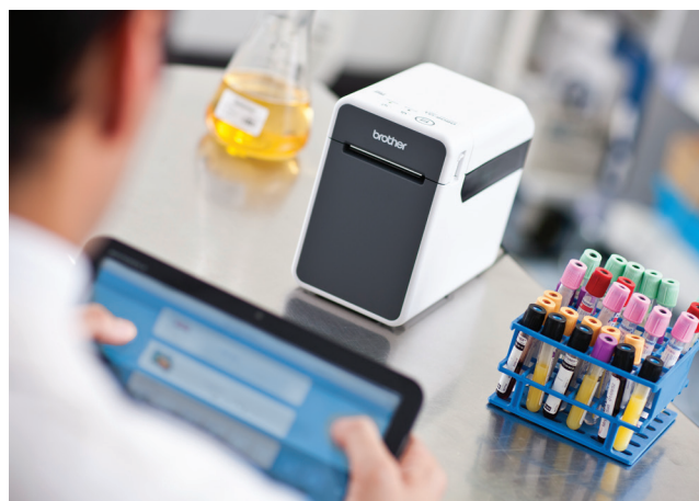
Increased freedom and mobility - print wirelessly from virtually any tablet or handheld device