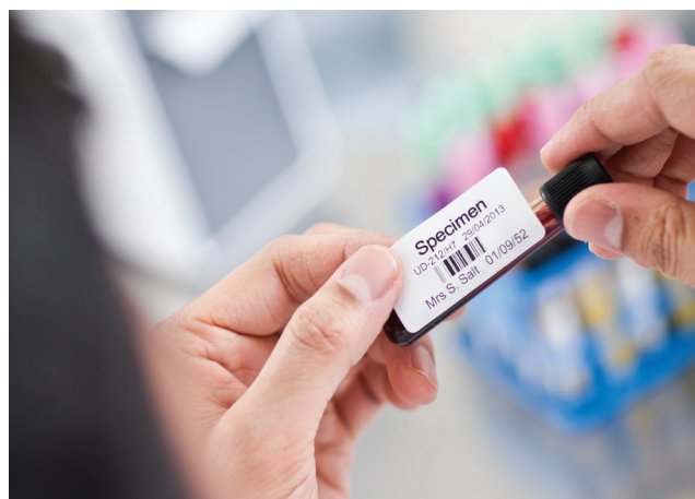
Simply apply your custom designed label

Support for ZPL® applications without extra development costs. Simply connect the device and adjust the built-in settings to whatever your system requires.