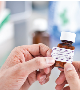
Label sizes can be adjusted to fit different sized tablet containers

The networkable TD-2120N and TD-2130N models provide healthcare workers with the option of wirelessly printing a variety of barcode labels quickly and whenever needed in the laboratory, pharmacy, front desk or even at the patient's bedside. With support for the most common barcode protocols, all models are ideally suited to any labelling task in healthcare.